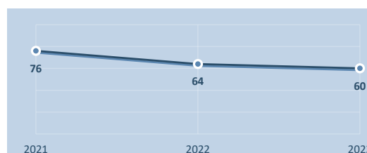
NUMBER OF COLLEGES IN THE EEA

EIOPA's engagement has been high in 2023, with an active involvement in more than 60% of the total number of colleges.